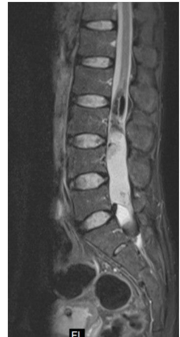
Fig. 3: STIR Mid Sagittal MR Image of Lumbar Spine Showing Suppression of Fat Appearing as Hypointense Signal Predominantly in the Upper One Third, Cystic Component Appearing Hyperintense in the Middle One Third and Hemorrhage Appearing as An Ill Defined Hypointense Signal in the Lower One Third