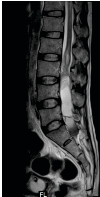
Fig. 2: T2 Mid Sagittal MR Image of the Lumbar Spine Showing Fat in the Solid Component Appearing as Well Defined Hyperintensity in the Upper One Third, Cystic Area Appearing Hyperintense in the Middle One Third and Hemorrhage within the Cystic Component Appearing as Ill-Defined Hypointense Signal