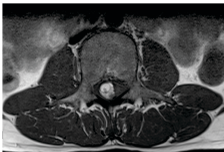
Fig. 4: T1 Axial MR Image through the Upper One Third of the Lesion Showing Hyperintense Fat Signal surrounding the Hypointense Subarachnoid Space