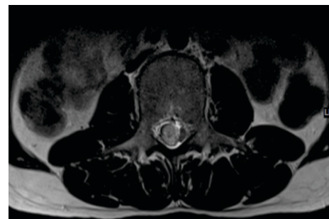
Fig. 5: T2 Axial MR Image through the Upper One Third of the Lesion Showing Hyperintense Fat Signal surrounding the Hyperintense Subarachnoid Space