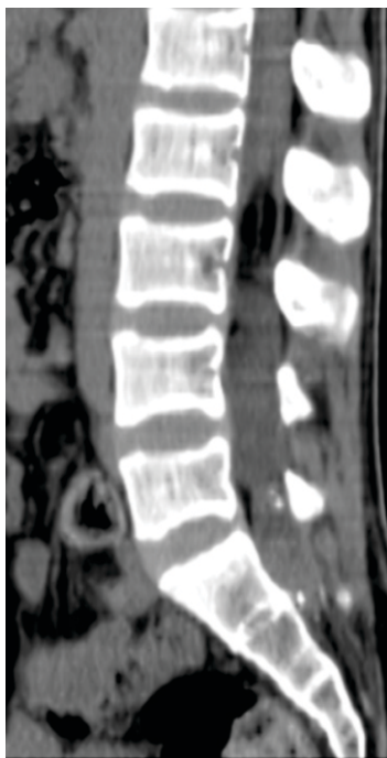
Fig. 6: Mid Sagittal Reconstructed CT Image shows the Hypodense (100 to -110 HU) Fat in the Upper One Third, Cystic Component Appearing Isodense (10 to 15 HU) in the Middle One Third And Hyperdense (40 to 50 HU) in the Lower One Third

Our patient underwent an excisional biopsy, which confirmed intramedullary dermoid cyst. The tumour could not be resected completely due to its tight adherence to the nerves. Hence the patient is being managed conservatively.